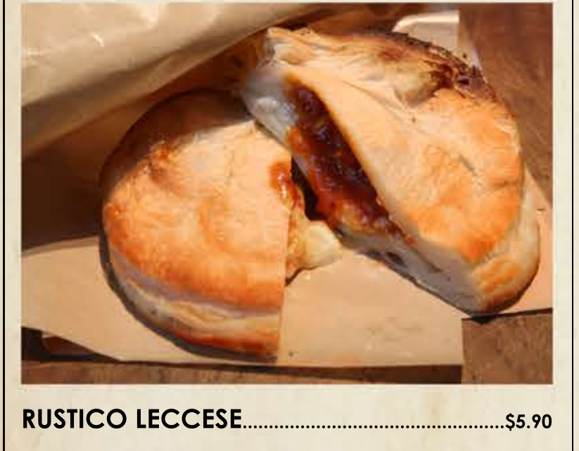
Italian buttery puff pastry with a gorgeous filling of tomato sauce, mozzarella cheese and béchamel.